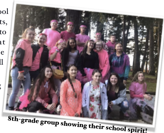
8th-grade group showing their school spirit!